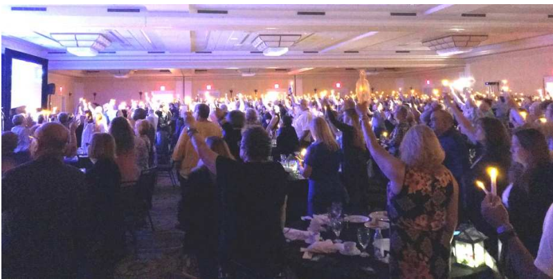
Candle Lighting activity